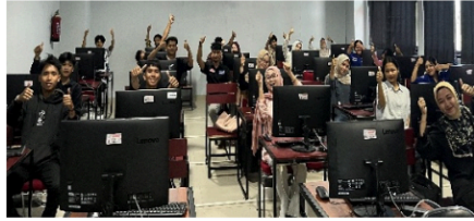
Figure 1. Research Subjects of Information Technology Education Students

Sulawesi during an academic implementation period, namely from September to October 2025. These restrictions are intended to allow for a focused and contextual analysis of the learning process in real-world classroom situations.