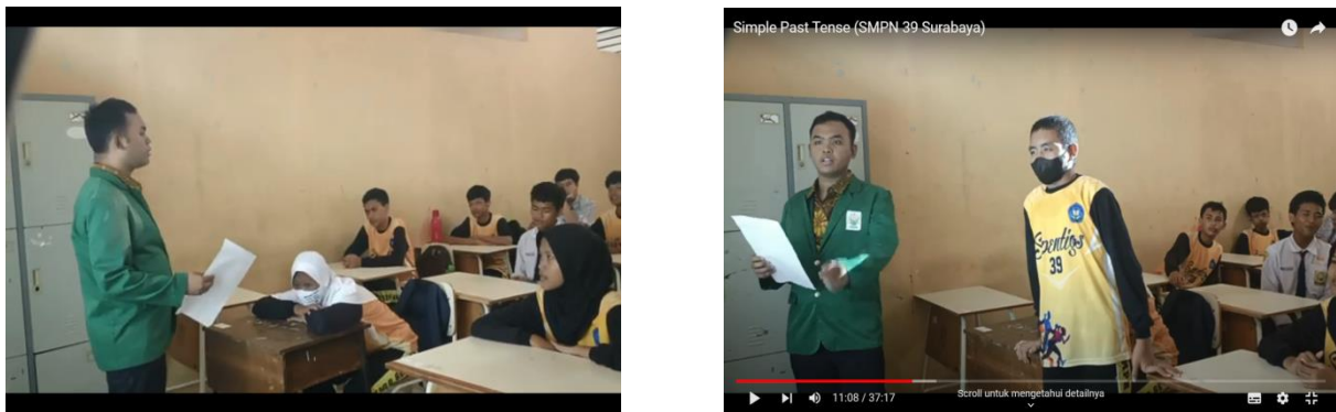
Figure 1. Screenshoot of the first day of ELT practicum youtube video.

The Figure 1 indicated the first day of the autistic student teacher applied his pedagogical competence in the ELT practicum. He was able to communicate with his students to open and explain the material but he had flat intonation and no contact eyes. Even, every time he explained the material he only read the material on the screen without having any improvisation and his body turned towards the screen and his back to the students without making eye contact with them. However, he was able to gave exercise to them and asked them to come forward one by one to answer it.