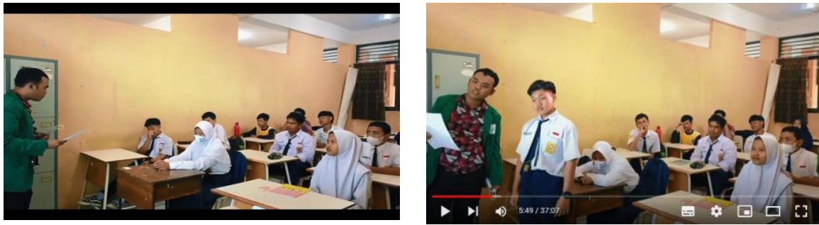
Figure 2. Screenshot of the second day of ELT practicum youtube video.

The Figure 2 indicated the second day of the AUTISTIC student teacher applied his pedagogical competence in the ELT practicum. On the second day, he was more communicative with his students than the first day. He was closer and more flexible with them. He could give question to them to answer individually by coming forward or answer together in the class. He was more responsive to them. It was proved when he could give correction to their answer if it was incorrect and need to be corrected. However, when he explained the material to them, he only read it and his body often turned towards the screen and his back to the students. Only sometimes he had eye contact with them.