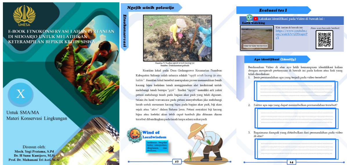
Figure 1. Integration of local wisdom into e-book learning media.

solve problems through thinking processes by incorporating local wisdom values into learning, with characteristics that can stimulate their motivation (Firdaus et al., 2020).