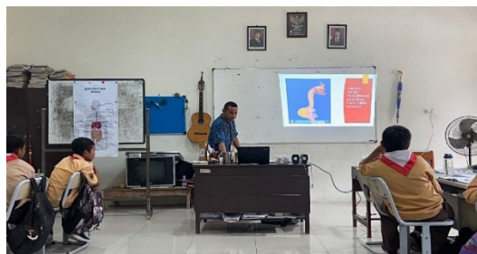
Figure 3. IPAS learning activities in grade V at SDN Ngaliyan 04 combining Canva digital media, physical aids, and Wordwall for an interactive quiz.

Figure 3 shows that the Grade V teacher (BG) teaches the subject of natural and social sciences (IPAS) with the topic of the Human Digestive System. BG uses a learning style that enhances student effectiveness and engagement. First, BG combines Canva-based digital learning media with simple props like posters of the human digestive system and food-shaped magnetic ornaments to help students understand abstract concepts more concretely and visually. The magnetic ornaments are actively moved above the poster depicting the digestive system, allowing for an interactive explanation of the food digestion process. Second, BG incorporates technology by using the Wordwall application for formative assessment, providing an engaging learning experience. Wordwall's features allow students to preview questions without immediately answering, creating a smooth quiz flow. Students write their answers in notebooks, helping bridge the technology gap among students and ensuring that the learning process remains inclusive, interactive, and equitable. Feedback from students indicated increased enthusiasm and motivation during the quiz, further confirming the effectiveness of this approach.