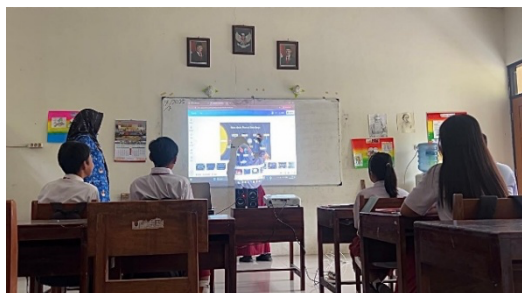
Figure 4. IPAS learning activities in Grade VI at SDN Ngaliyan 04 using Canva digital media and whiteboards to support interactive lessons despite limited technology.

Figure 3 shows that the Grade V teacher (BG) teaches the subject of natural and social sciences (IPAS) with the topic of the Human Digestive System. BG uses a learning style that enhances student effectiveness and engagement. First, BG combines Canva-based digital learning media with simple props like posters of the human digestive system and food-shaped magnetic ornaments to help students understand abstract concepts more concretely and visually. The magnetic ornaments are actively moved above the poster depicting the digestive system, allowing for an interactive explanation of the food digestion process. Second, BG incorporates technology by using the Wordwall application for formative assessment, providing an engaging learning experience. Wordwall's features allow students to preview questions without immediately answering, creating a smooth quiz flow. Students write their answers in notebooks, helping bridge the technology gap among students and ensuring that the learning process remains inclusive, interactive, and equitable. Feedback from students indicated increased enthusiasm and motivation during the quiz, further confirming the effectiveness of this approach.