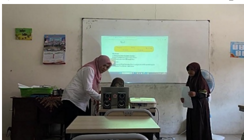
Figure 2. IPAS learning activities in grade IV at SDN Ngaliyan 04 using YouTube Edu and Liveworksheets, with physical worksheets as an alternative.

The use of information and communication technology (ICT) for learning involved digital tools and platforms such as multimedia, online applications, and electronic learning resources to improve interactivity, effectiveness, and accessibility in teaching and learning. This was observed and reported by informants RD, BG, and SR. Teachers used various digital platforms, including interactive presentations, videos, and online learning applications, to deliver materials. Constraints like limited access to devices among students were noted, prompting teachers to adapt by providing printed materials and offering extra training to improve students' technical skills. Teachers also gave instructions on digital etiquette and internet safety and involved parents in supporting learning at home (Interview, 27 February - 20 March 2025). Observations of learning activities in upper grades (IV, V, and VI) confirmed these practices: